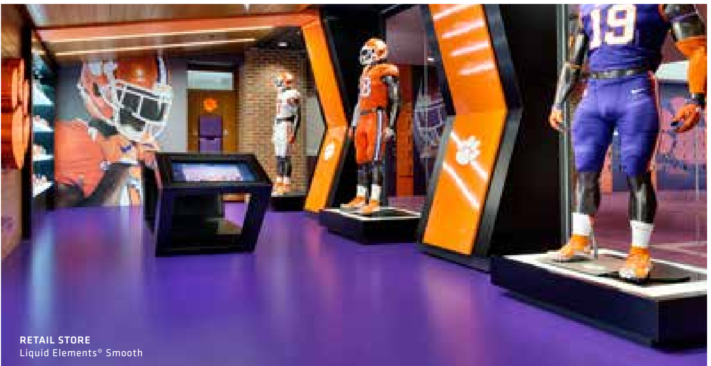
RETAIL STORE Liquid Elements® Smooth

Our floors and walls are seamless and non-porous. Seamless means there is no where for dirt and bacteria to get trapped, which means sanitary surfaces. This is critical in kitchens, food service, restrooms and locker rooms. No seams also means they are much easier to clean. In addition, these systems are chemical-resistant so they withstand continuous cleaning with sanitizing cleansers. The combination of a monolithic surface, along with stain and chemical resistance put them in demand for high-traffic spaces like stadiums.