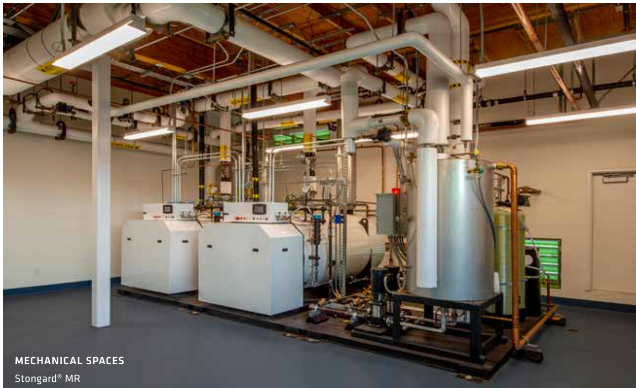
MECHANICAL SPACES Stongard® MR