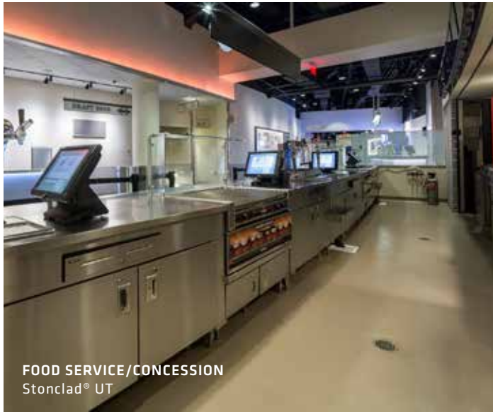
FOOD SERVICE/CONCESSION Stonclad® UT