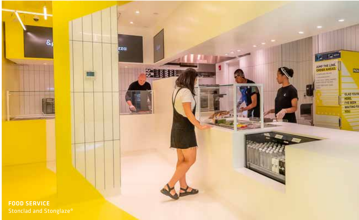
FOOD SERVICE Stonclad and Stonglaze®

WE HAVE POURED-IN-PLACE SOLUTIONS FOR STADIUMS, INVITING PUBLIC SPACES AND BEHIND THE SCENES WORK AREAS THAT PROTECT CRITICAL EQUIPMENT THAT SUPPORT OPERATIONS.