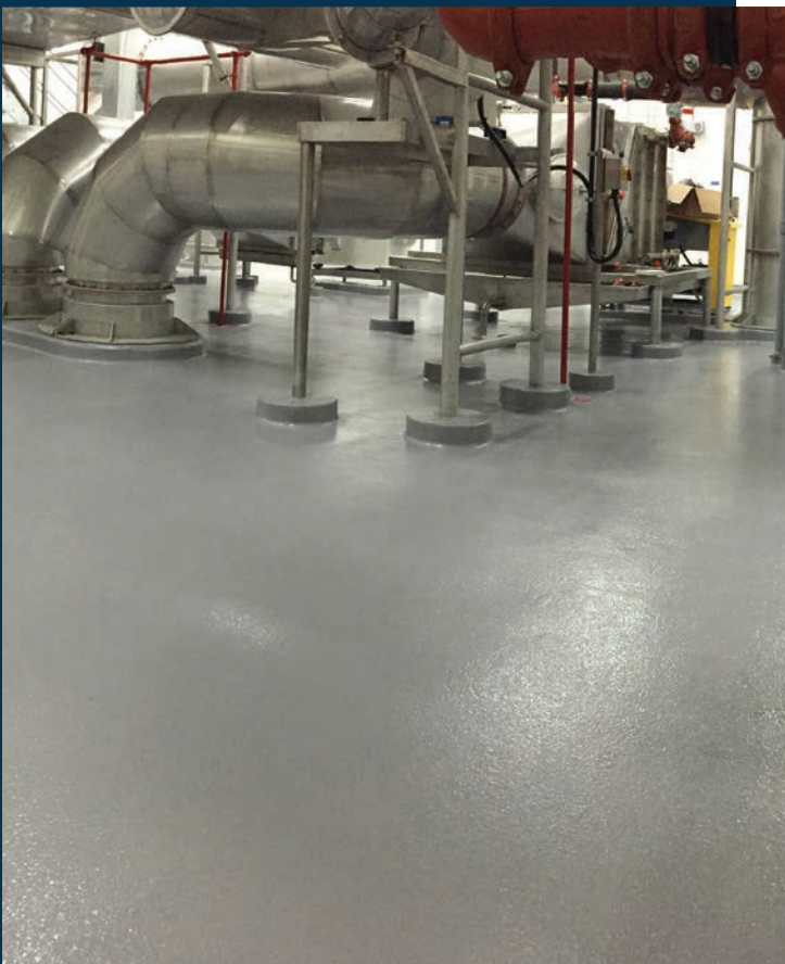
PROCESSING AREAS Stonclad