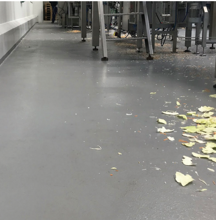
PROTECTIVE SANITARY CURBS Polysto