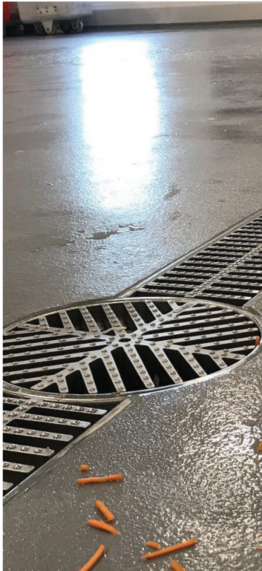
DRAIN SYSTEMS Blücher

Stonhard is the exclusive provider of EHEDG-certified PolySto hygienic curbs to offer the best solutions to our food & beverage clients. PolySto, the leading producer of hygienic wall protection for the food and beverage industry, manufactures prefabricated, polymer composite curbs to provide wall protection at a higher level than those composed of concrete. Both Stonhard floors and PolySto curbs are chemical resistant, water resistant, and easy to clean.